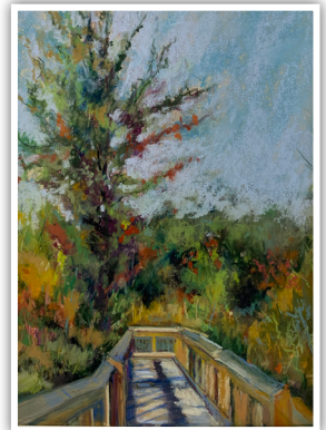
Mary Firtl's "Lydick Bog Morning"

Lydick Bog Nature Preserve is west of South Bend at 25898 U.S. Highway 20, South Bend, IN heinzetrust.org/lydick-bog-nature-preserve .