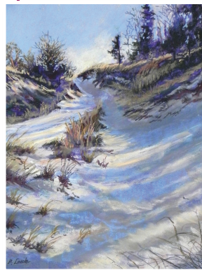
Duneland Ascent by Peg Luecke

The theme is "Creating Contrast with Pastels." Follow this link for details and to register: https://www.chestertonart.org/adult-classes-and-workshops/p/pastel-workshop